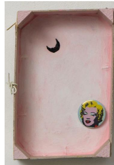
C.O. Paeffgen L'Amour , 1971 Acrylic on photocanvas 110 x 100 cm