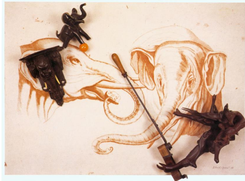
Daniel Spoerri Carnaval des Animaux: Menschliche Abbildung verglichen mit der vom Elefant , 1995 100 x 140 x 70 cm