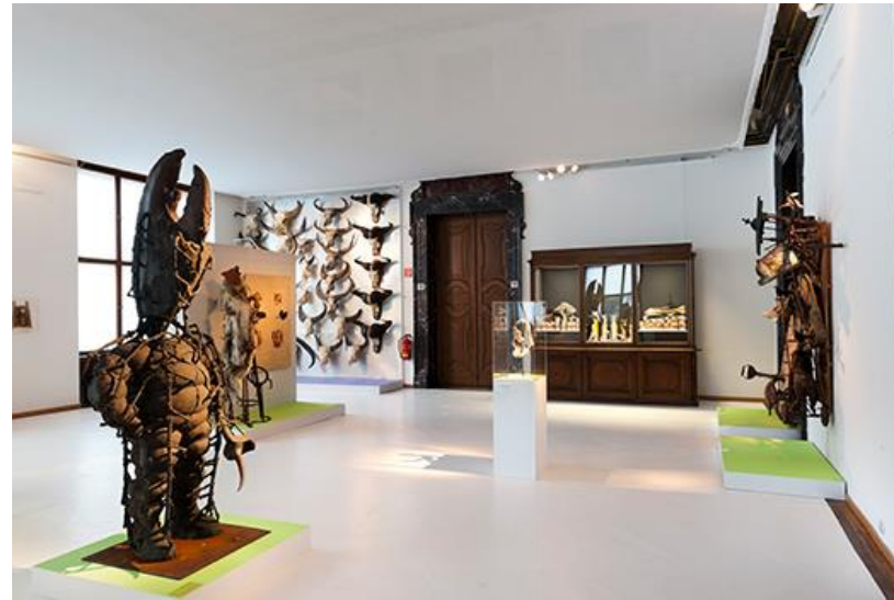
Daniel Spoerri im Naturhistorischen Museum – ein inkompetenter Dialog?, Naturhistorisches Museum, Vienna, Austria, 2012