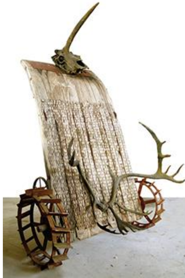
Daniel Spoerri Tribulum und Einhornkuh , 2008 Assemblage 220 x 180 x 180 cm