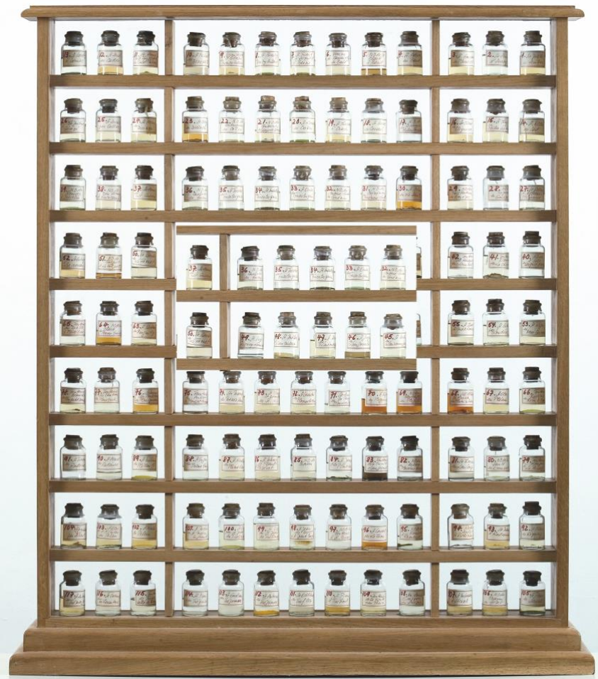
Daniel Spoerri Bretonische Hausapotheke , 1981 Assemblage 103 x 103 x 24 cm