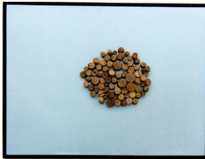
Jan Henderikse Untitled , 1968 Coins on panel 122 x 122 cm