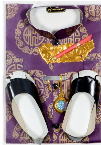
Jan Henderikse p8 , 2005 Paper object on canvas 24 x 30 cm