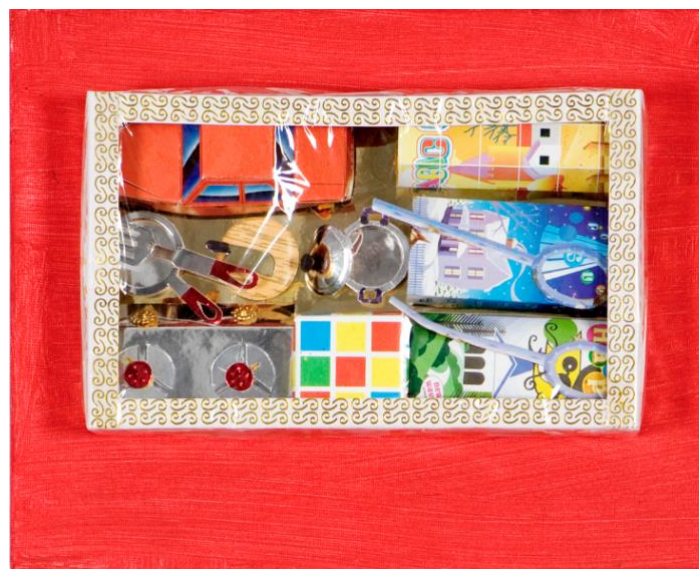
Jan Henderikse Giesskanne , 1987 Rubber object 63,5 x 53 cm