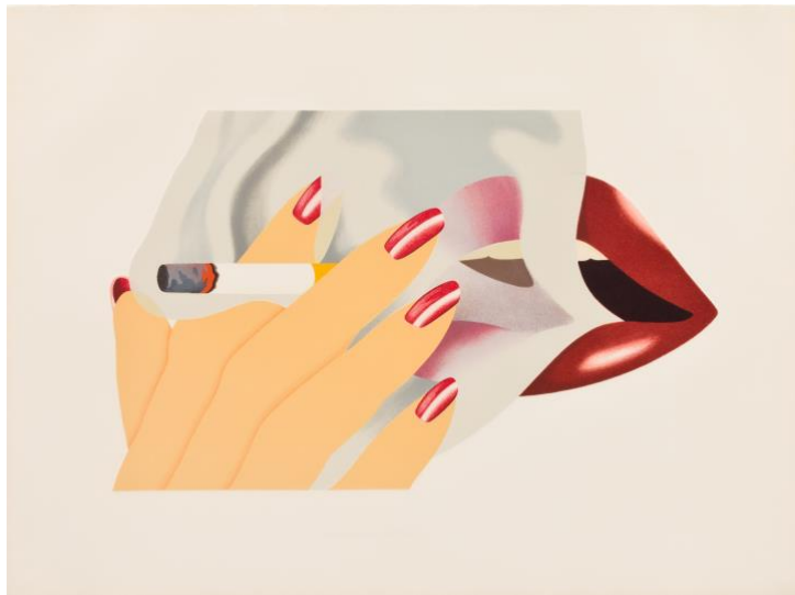
Tom Wesselmann Smoker , 1976 Lithography 36,5 x 58,5 cm