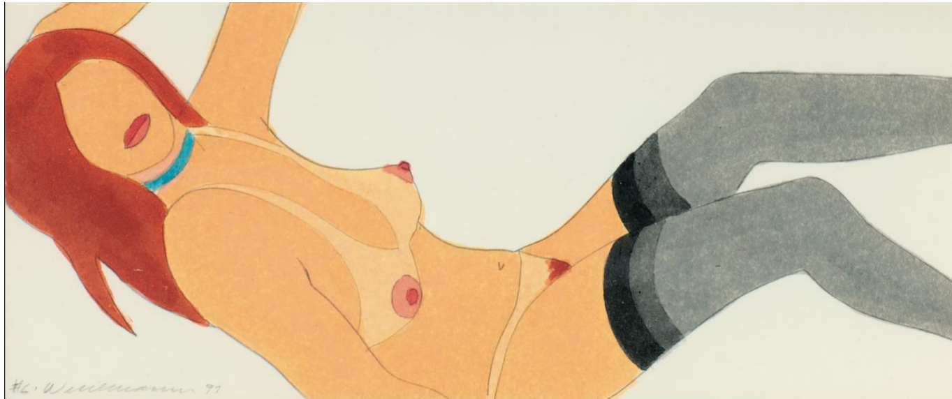
Tom Wesselmann Beautiful Kate , 1997 Pencil and Liquitex on cardboard 9,5 x 22,2 cm