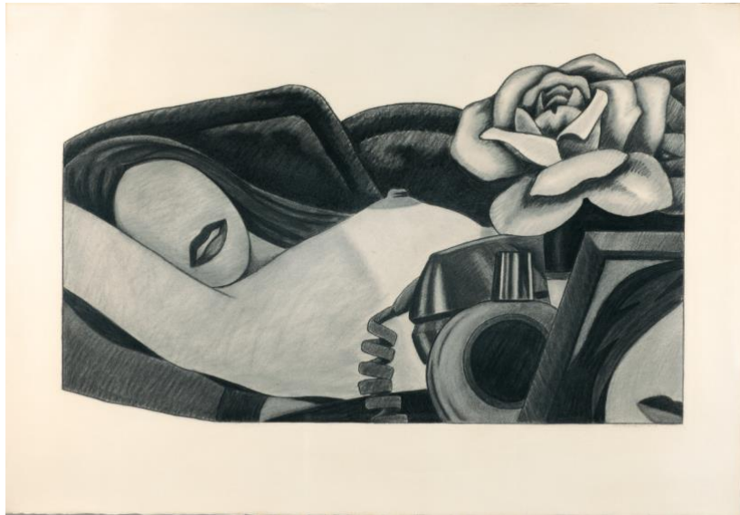
Tom Wesselmann Drawing for Great American Nude , 1977/79 Charcoal on 100% rag paper 92 x 132,5 cm