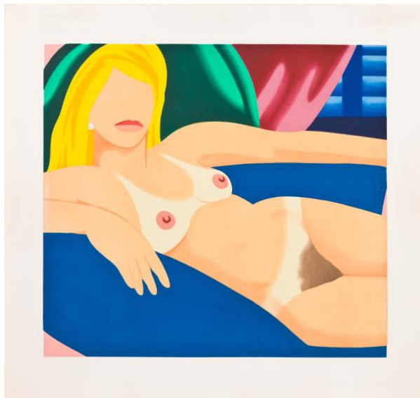
Tom Wesselmann Nude , 1980 Aquatint 71 x 76,7 cm