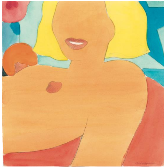
Tom Wesselmann Study for Great American Nude #75 , 1965 Pencil, Liquitex and watercolor on paper 30,5 x 29,8 cm