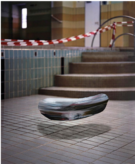
Marc Lüders Objekt 718-8-1 , 2011 Oil on Cibachrome print 140 x 114 cm