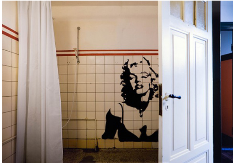
Marc Lüders Graffiti 759-1-1 , 2009 Oil on Kodak Endura Metallic print 150 x 100 cm