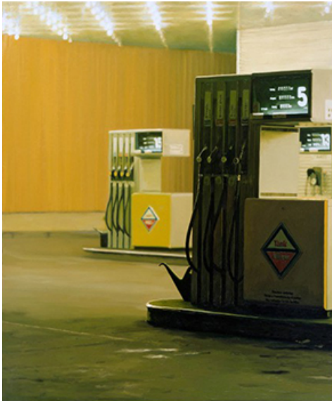
Marc Lüders Tankstelle 538-7 , 2001 Oil on Cibachrome print 115 x 96 cm