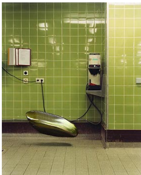
Marc Lüders Objekt 648-5-1 , 2004 Oil on Cibachrome print 12 x 18 cm