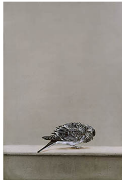
Marc Lüders Vogel 273-6-1 , 1999 Oil on silver gelatine print 88 x 60 cm