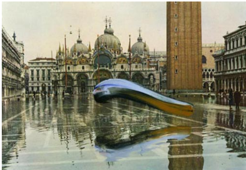
Marc Lüders Postkarte #130: Venezia Piazza San Marco con acqua alta , 2003 Oil on postcard 10,3 x 14,9 cm