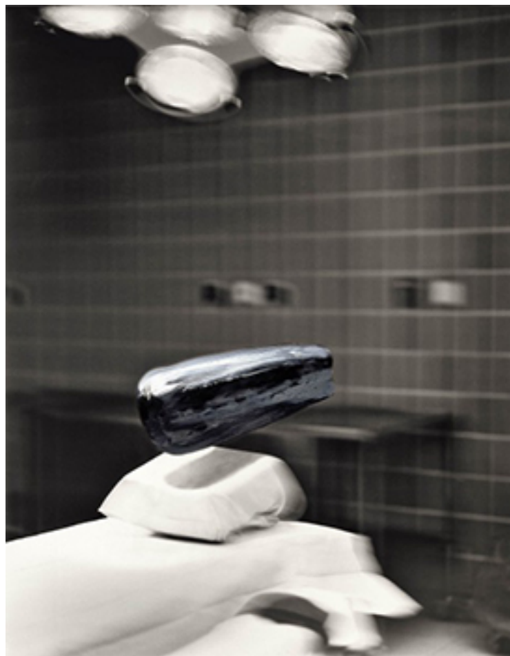
Marc Lüders 732-10-1 , 2007 Oil on Cibachrome print 160 x 107 cm