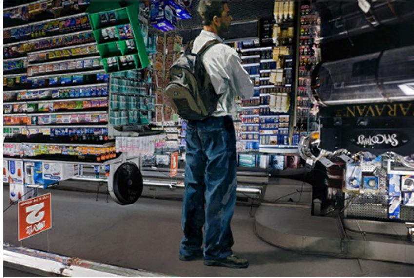
Marc Lüders Figur 809-7-1 , 2014 Oil on Cibachrome print 150 x 100 cm