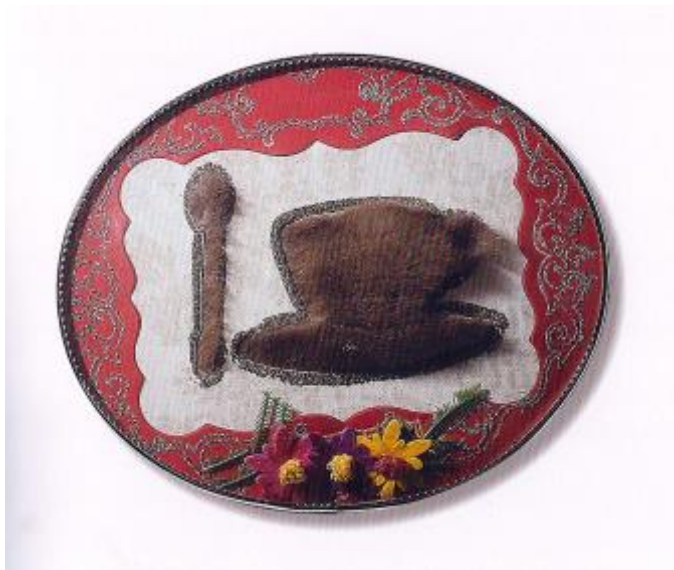
Meret Oppenheim Andenken an das „Pelzfrühstück“ , 1970 Collage underneath oval glass 17,5 x 20 x 4 cm