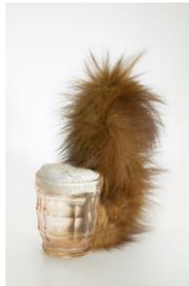
Meret Oppenheim Eichhörnchen , 1969 Diverse materials 23 x 17,5 x 8 cm