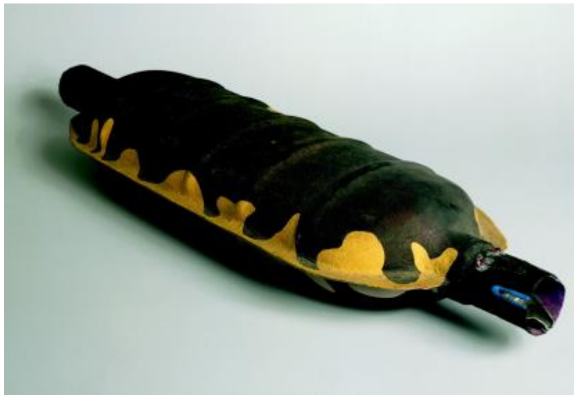
Meret Oppenheim Termitenkönigin , 1975 Painted exhaust pipe 70 x 10 x 20 cm