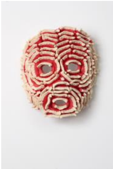
Mariella Mosler Maske (Dracula) , 2010 Fruit gum 27 x 23 x 10 cm