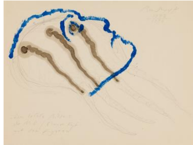
Eduardo Arroyo Meret Oppenheim , 1993 Watercolor and pencil on canvas 56 x 38 cm