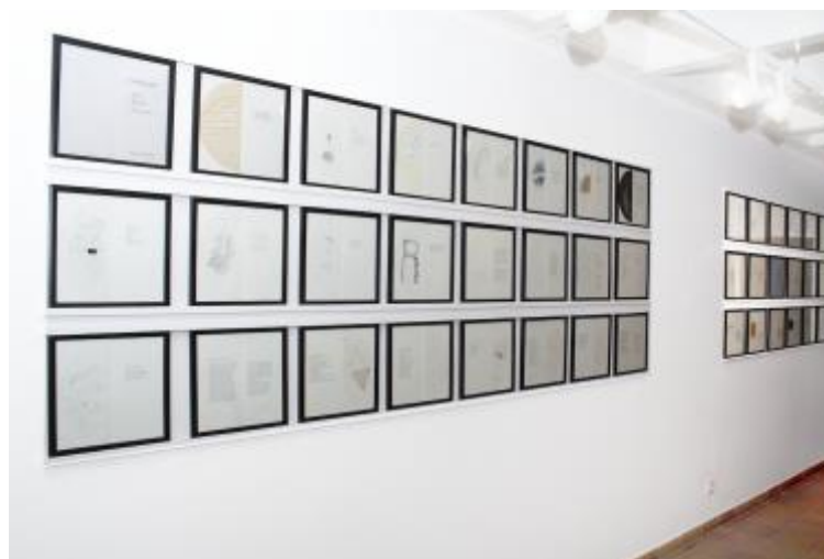
Meret Oppenheim Mirrors of the mind , Jüdisches Museum Rendsburg – Schloß Gottdorf, Germany, 2013