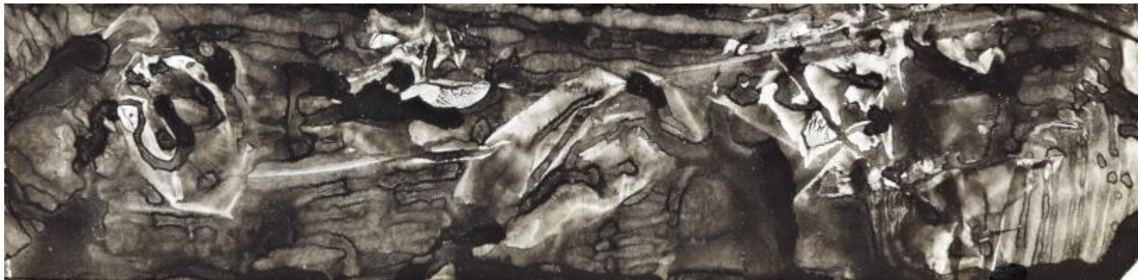
André Breton St. Antoine , ca. 1957 Decalcomania, gouache on paper 8 x 22 cm