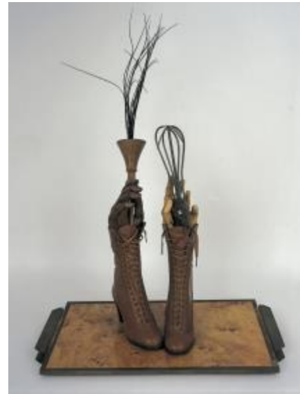
Meret Oppenheim Oat-Flower , 1969 Diverse materials H: 50 cm