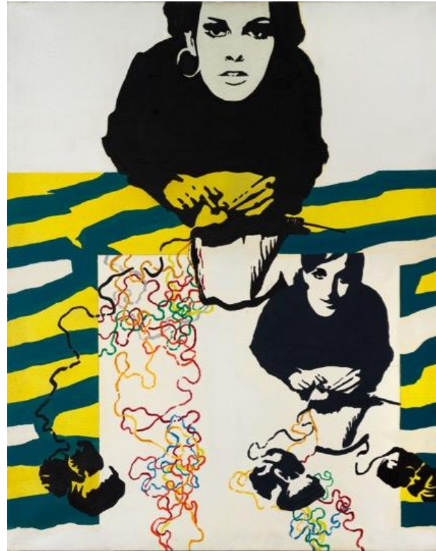
Werner Berges Strickliese , 1967 Oil on canvas 130 x 102 cm