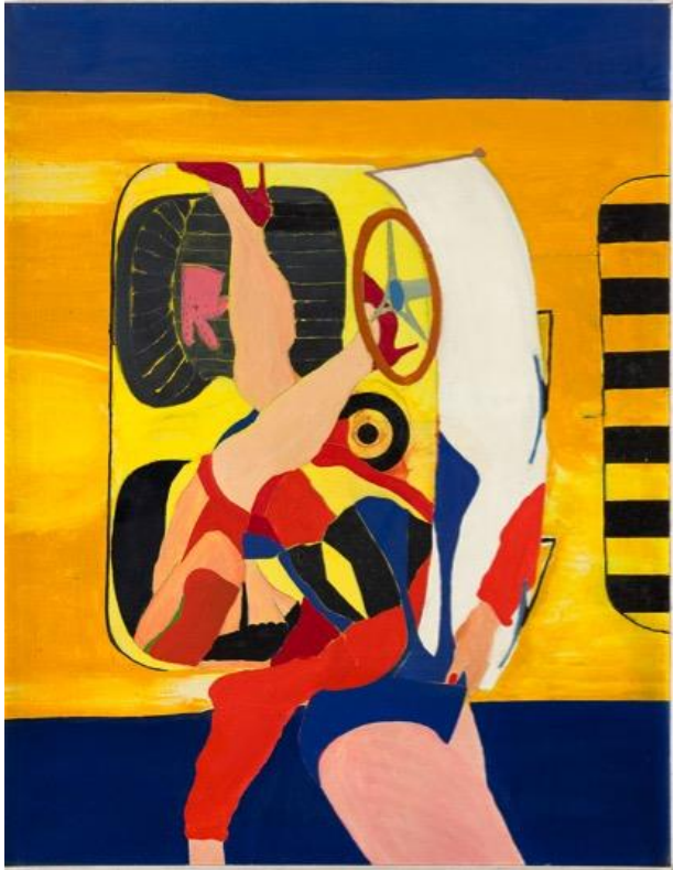
Werner Berges Lady , 1966 Mixed media on canvas 130 x 100 cm