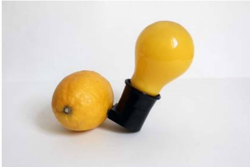
Joseph Beuys Capri Batterie , 1985 Lightbulb with socket in wooden box, lemon 8 x 11 x 6 cm